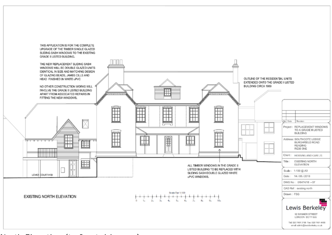
North Elevation (to front driveway)